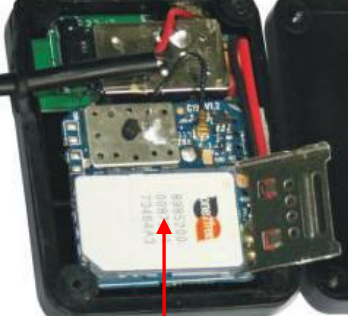
SIM Card face down