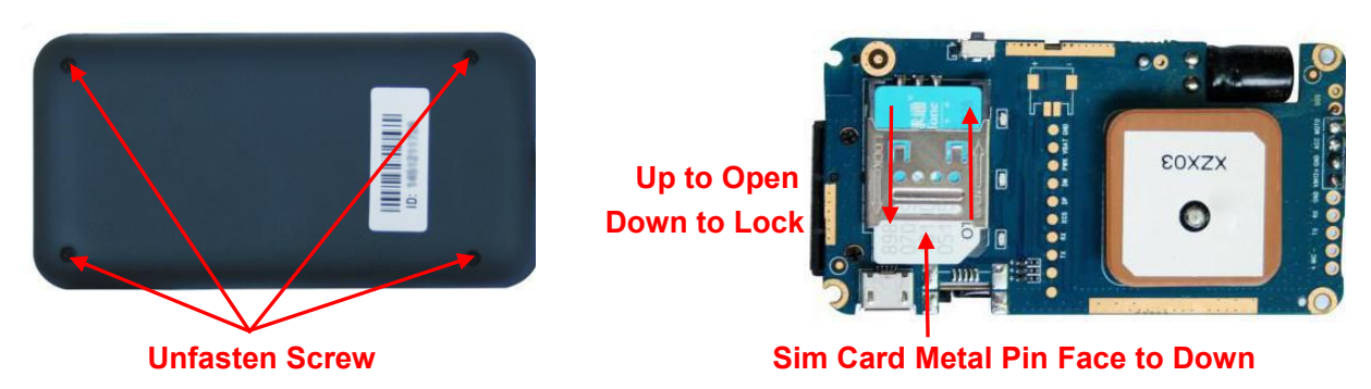
Note: 1. This tracker use 2G GSM network, and it upload tracking only through GPRS, it can not work in CDMA network or 3G(WCDMA or CDMA2000) network. (Some 3G SIM card can use in 2G GSM network, this kind of 3G SIM card can use in this tracker)

Unfasten the screw on the back case of the tracker, and open the case of the tracker, the SIM card holder will be seen, pull the metal cover to "OPEN" direction, and the cover can be opened up, and put the SIM card in the holder (Metal pin face to down), close the metal cover and push the metal cover to "LOCK" direction, after a sound of lock the SIM card has been locked and installed.