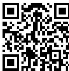
Android App Download