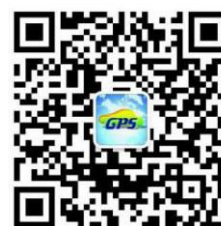
Wechat Official Account