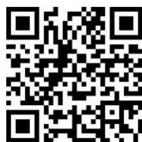
QR-Manual Download (Word)

This GPS tracker can be used as car alarm, fleet management, driver management etc, it can be used for tracking cars, company vehicles, buses, taxis, trucks, etc.